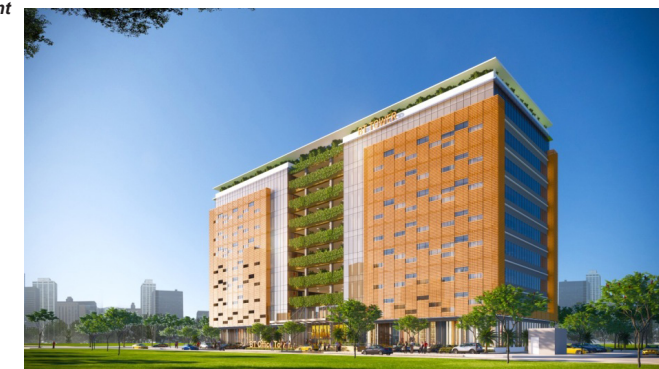
Ba Thien Executive Office Address: Ba Thien Industrial Park, Vinh Phuc - Scale: 22,100 m 2

CONTACT INFO: Sagen Constructive Design Consultancy Joint Stock Company Address: 38 Lam Son, Ward 06, Binh Thanh District, HCMC Phone: 028. 3510 9900 - Hotline: 0906.605.099 Web: www.sagen.com.vn - Email: sagen@sagen.com.vn