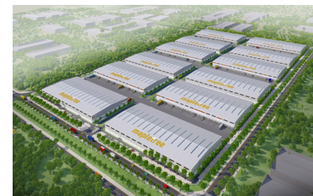
Hung Yen Logistics Park I of Mapletree Address: Viglacera Yen My - Hung Yen Industrial Park Scale 280,000 m 2

The year 2021 is approaching, Sagen will focus on strategic tasks: Improve capacity in all aspects to meet customer requirements and prepare to deploy BIM/REVIT synchronously in Q2/2020 to bring new innovations. the most optimal products, providing services that bring international standards to the domestic market as well as fulfilling the aspiration to elevate the Sagen brand to the international market.