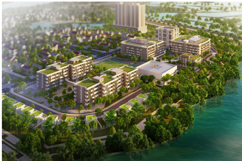
FPT University in Binh Dinh Address: Quy Nhon City, Binh Dinh Province - Scale: 30,000 m 2