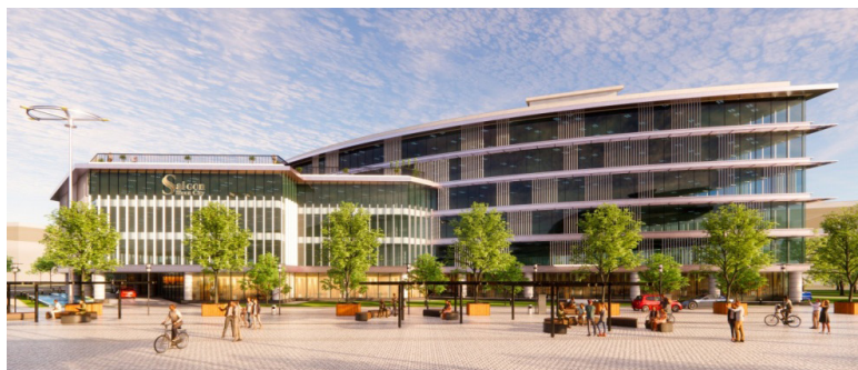
Center 3 and Central Square of Sai Gon Silicon City (SSC) 52.9 ha Address High-Tech Park, Dist.9, HCMC - Scale: 60,000 m 2