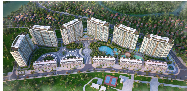
Ho Tram Complex Address: Ba Ria - Vung Tau - Scalw 206,000 m 2

Accordingly, investment activities, construction of factories, warehouses, workshops as well as real estate investment projects decreased sharply, causing the construction industry in general and the design consulting industry in particular to face challenges. big wake. With the determination to overcome difficulties, 2020 has become Sagen's pride when surpassing major competitors, becoming a reliable partner to sign contracts to implement a series of large projects such as Ho Tram Complex. Complex with more than 7.5 hectares in Ba Ria - Vung Tau (Hung Thinh), Saigon Silicon City (SSC) 52 hectares in High Industrial Park in District 9, Aqua City - Bien Hoa Trade Center over 30,000 m 2 (Novaland), School FPT University in Binh Dinh and Can Tho (FPT Education), Nam A Bank Can Tho office building (Hoan Cau Group) ... In which, the Ho Tram Complex project is expected to become an ideal place to live and relax. New project in Ba Ria - Vung Tau with a scale of 22-storey apartment complex with GFA of more than 206,000 m 2 , cluster of 3-storey commercial buildings (5 blocks) with GFA of more than 15,400 m 2 , cluster of Primary schools