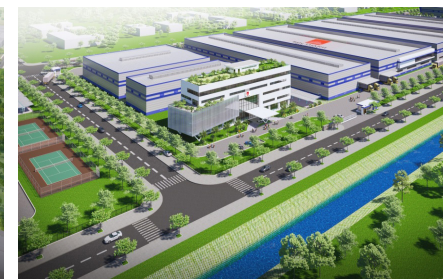
Industrial Cluster's for manufacturing Medical Equipment Address: Mong Cai - Quang Ninh Scale: 246,000 m 2